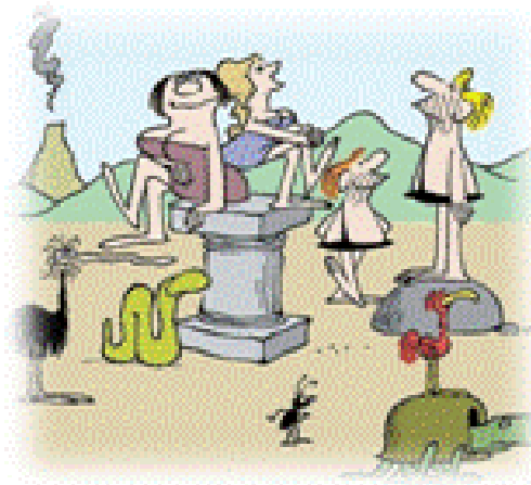
Figure 1. Johnny Hart's Characters

Just this past week one of the great cartoonists and illustrators went home to be with the Lord on Saturday, April 7, 2007, at age 76 while working at his home in Nineveh, N.Y. Many of you read and loved the syndicated cartoon, 'B.C.' Johnny Hart was an outspoken Christian whose faith always shaped his Easter morning cartoon. Hart's 'B.C.' strip was launched in 1958 and eventually appeared in more than 1,300 newspapers with an audience of 100 million. 9